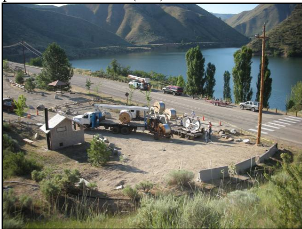
Staging area for construction crews as they prepare to pull wire (Lucky Peak Reservoir in background)

Visit the PUD's website, www.clatskaniepud.com , to view a photo gallery of the construction progress and read about updates on the project. If you have any questions about this project, please call the PUD (503) 728-2163 or e-mail us at clatspud@clatskaniepud.com .