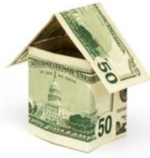
An energy efficient house can help save you money

Would you like to lower your electric bill? Clatskanie PUD can help. If you haven't done so already, call the PUD to schedule a free analysis of your home. A PUD energy service representative will come to your home and discuss several options to make your home as energy efficient as possible. Many of these options can include a cash rebate from the PUD, including the replacement of old windows, sealing your furnace ducts, installing a high efficiency heat pump or insulating your floors, walls, and/or attic. Another way to save energy and money is to replace your old appliances with qualified Energy Star Appliances. Currently, if you purchase a qualified clothes washer, freezer, dishwasher, refrigerator or water heater, you are eligible for a $50 rebate. To find out if your appliance