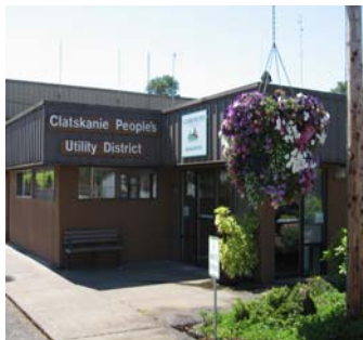
Existing office at 469 North Nehalem St.

With limited space at the existing location, the PUD considered two options based on a previous architect study. We could either undergo a major remodel at the existing site or find a new site. Pursuing a new location option, the PUD purchased the old Valley Mobile Home Park property last July. The property consists of nearly 9 acres conveniently located along Highway 30, near the downtown area. The new location will house a new headquarters office, warehouse, and pole yard. Initial clearing and filling of the property has been