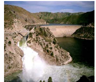
Photo on file of Arrowrock Dam